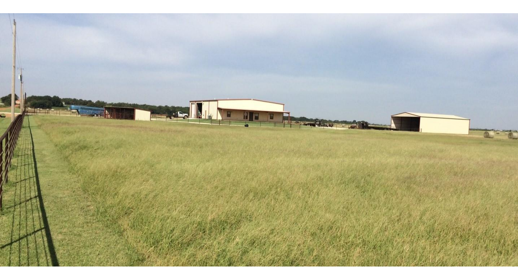
View looking West across the Bermuda field from the roping arena.