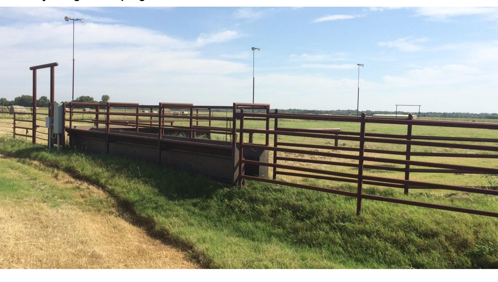
Lead up alley to roping arena. All pipe and cable with lights.