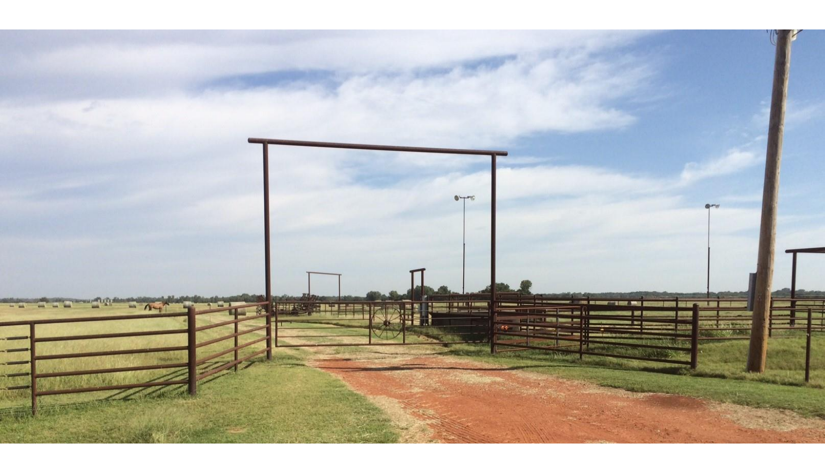
Entry to lighted roping arena