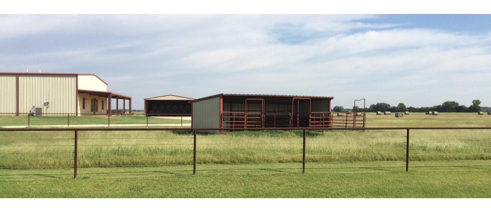
One of two "Three sided" horse/livestock shelters. Pipe and cable fence constructed from new 2 3/8's material.