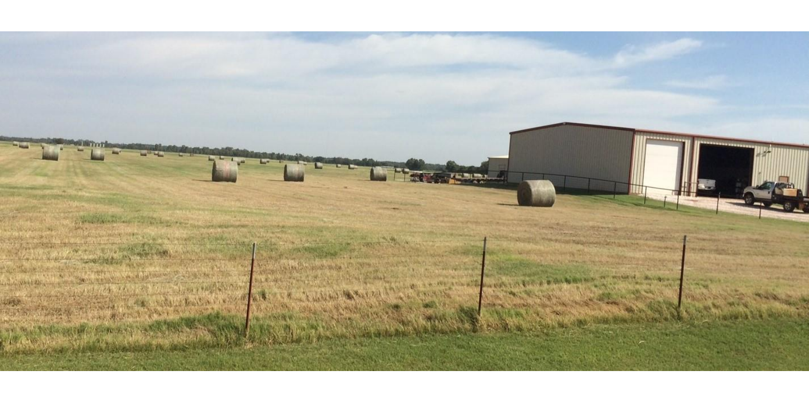
Highly productive Bermuda field and excellent fence.