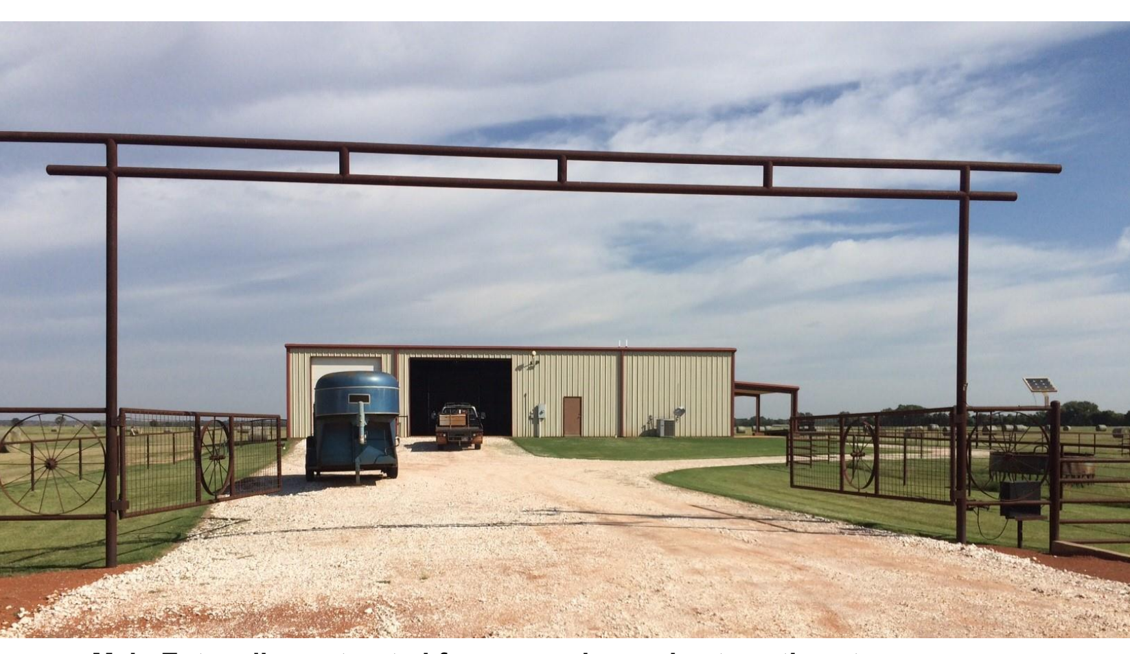
Main Entry all constructed from new pipe and automatic gate.