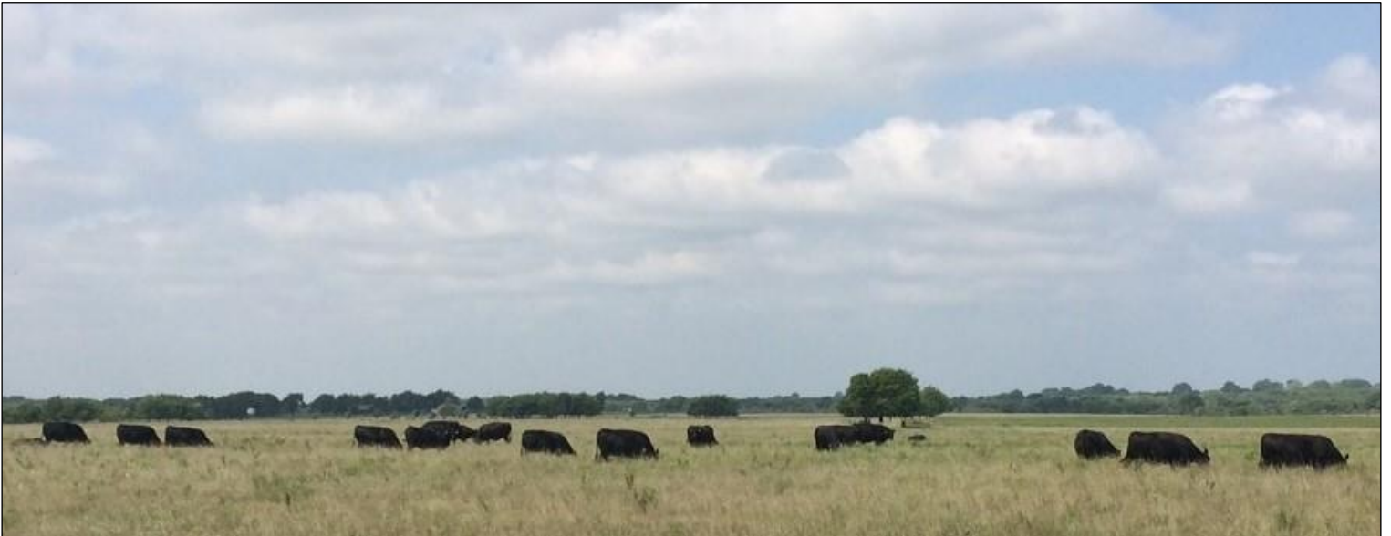
The grass is a mix of native, Bermuda & Fescue, mostly along the creek bottom