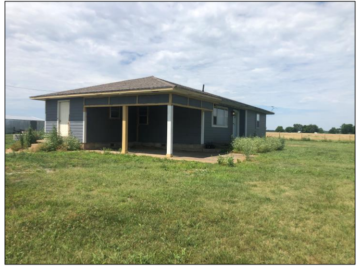
1,200 +/- sq ft. house