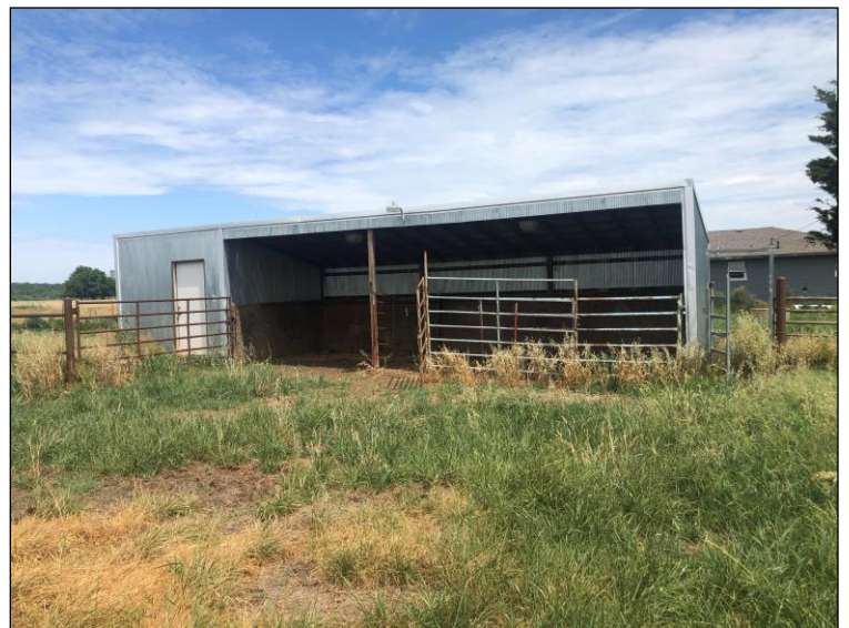
Three sided horse/livestock shed