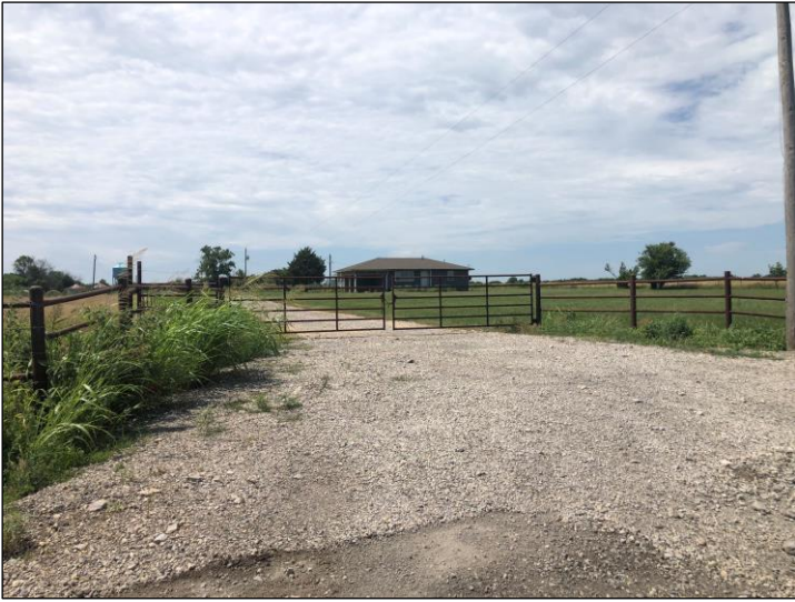
Entry off E0180 road