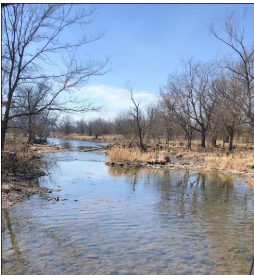
Salt Creek dissects the land